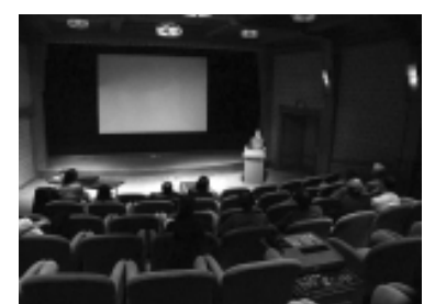
FREE EVENT, REFRESHMENTS

DOLBY LABS SCREENING ROOM 100 POTRERO AVE, SAN FRANCISCO