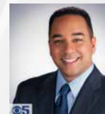
Devin Fehely CBS Bay Area, KPIX