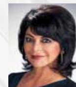
Roberta Gonzales Roberta Gonzales Productions KTVU Fox 2 Silver Circle 2013