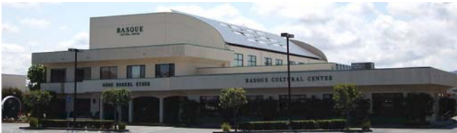
Basque Cultural Center, South San Francisco

SATURDAY, NOVEMBER 11, 2023 11:00 a.m. No Host Reception 12:00 p.m. Scholarships & Luncheon 1:00 p.m. Induction Ceremony