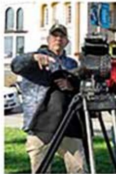
This Year Nominated for "Never Too Late?" Diversity/Equity/Inclusion - Long Form

Proceeds to benefit Sheldon Fay Videography Scholarship